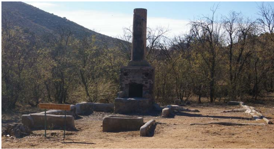
Teskey home site looking south - November 2012