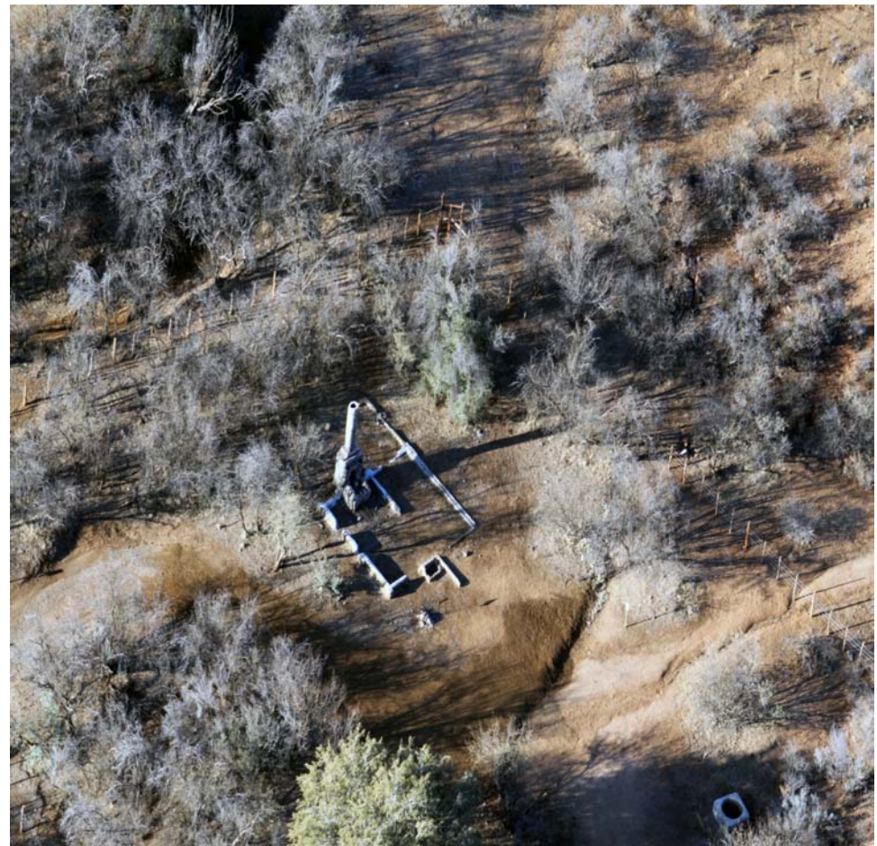
Aerial photo December 2009