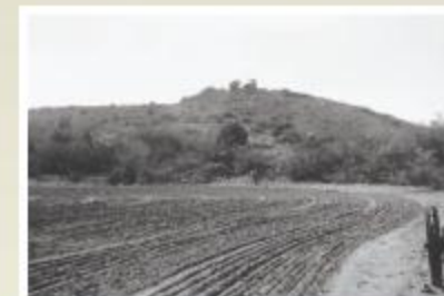
Six acres of hay and grain fields